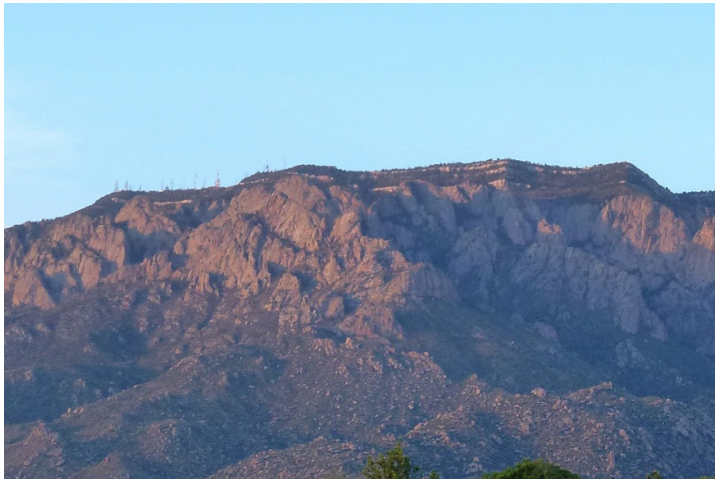
Sandia Peak, nearing sunset. Sometimes it can be easy to see why this peak is called Sandia, or Watermelon in Spanish.