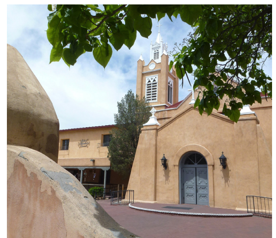
San Felipe de Neri Parish in Old Town.