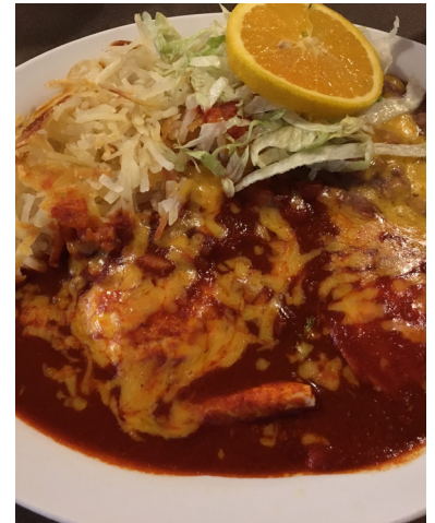
New Mexican Huevos Rancheros with red chile sauce.