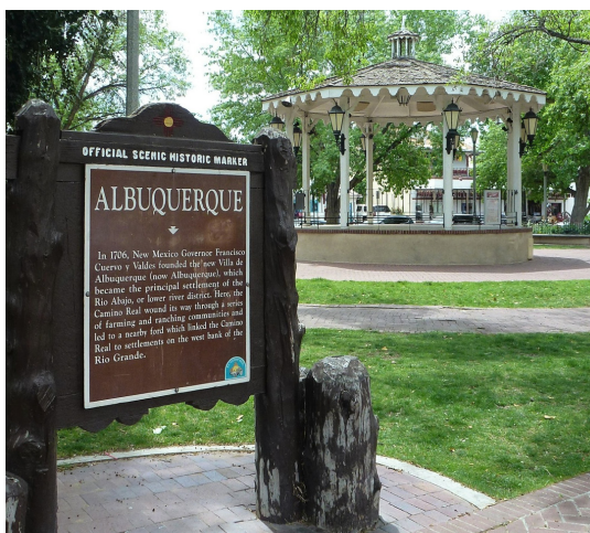
Old Town Albuquerque Plaza.