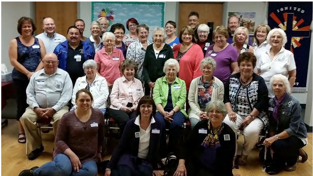
Every One His Witness Workshop Attendees

looking forward to using the materials that Synod is preparing for congregational use based on the workshop. There was no charge for the workshop; all resources were supplied by LCMS. A Thrivent Action Team Grant was used to provide food for the attendees. Thank you to all who helped prepare for this workshop and to all who attended. This workshop was one of five presented for LWML districts.