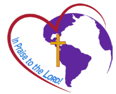
2019 National Convention

With all the news about our upcoming district convention in 3 months, it might be easy to miss that another one is just around the corner. The national LWML 38th biennial convention will be held in Mobile, Alabama, June 20–23, 2019. The theme is “In Praise to the Lord!” based on 1 Chronicles 16:23–24a: Sing to the Lord, all the earth! Tell of His salvation from day to day. Declare His glory among the nations. For more information and convention publicity, visit www.lwml.org/2019-convention .