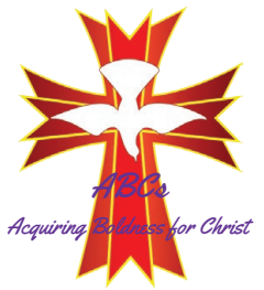
LWML RMD Board of Directors

The Mission Grant Committee shared “Mission Minutes” with attendees; copies of the “Mission Minutes” will be on the lwmlrmd.org website.