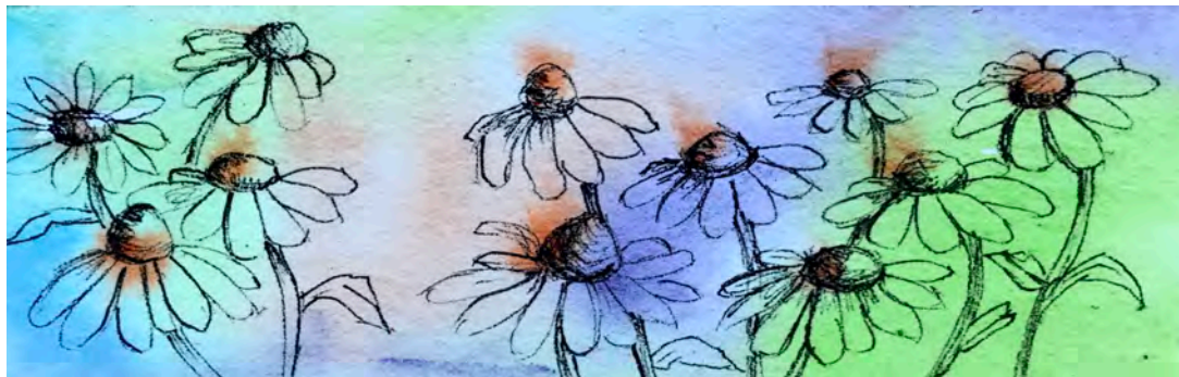
Around the District

While most Zones will celebrate at their Fall Rallies, they will look a little different this year. Due to changing circumstances, at press time, limited information is available. Some rallies will be held in person, while others will be over Zoom and still others will have a hybrid option available. Please check with your society and Zone president for more details. However your Zone chooses to meet, be sure to send some photos or anecdotes that we can use in our next publication of Tidings .