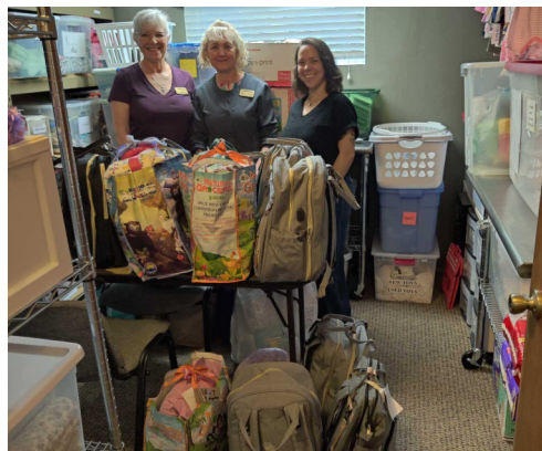
LIFE CHOICES, LOVELAND, CO

from Immanuel, Loveland delivered approximately half of our 43 Baby Bags, 77 Layettes (w/o backpacks), and abundance of assorted baby items to Life Choices in Loveland. I delivered the other half to Life Choices in Longmont. Both centers were thrilled to receive our Gifts from the Heart as you can see from the photo taken at Life Choices in Loveland.