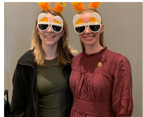
YWR'S HELPED WITH THE GIFTS