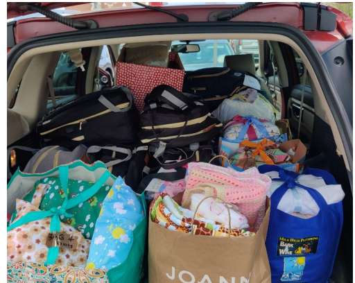
Bags for Life Choices, Longmont, CO (below)