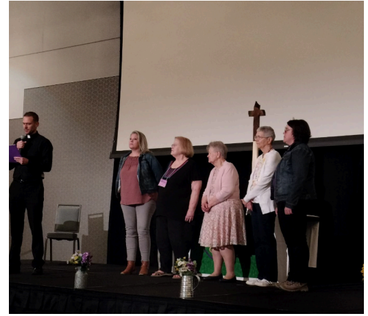
New officers (above)