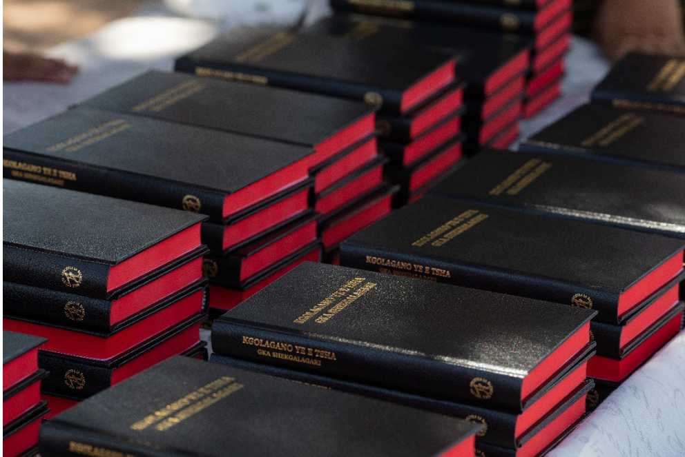
#1 Newly Dedicated Shekgalagari Bibles, Botswana