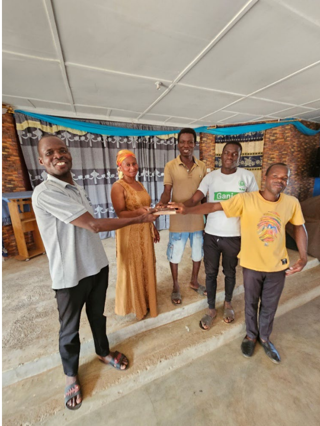
#3 Komba New Testament Dedication, Ghana