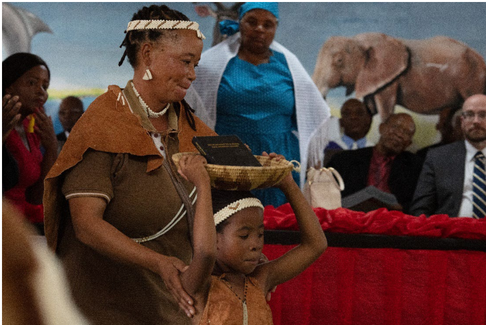
#2 Dedication Ceremony of the Shekgalagari Bible